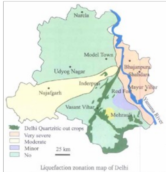
Liquefaction Zonation Map